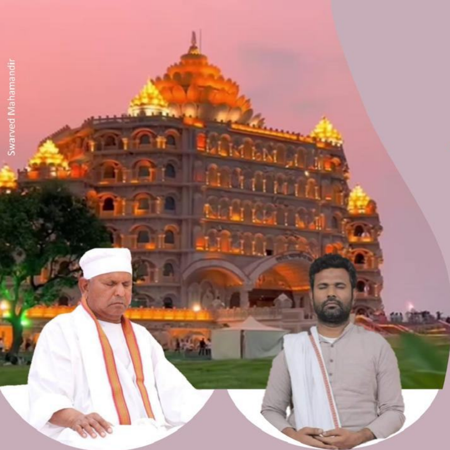
Sadguru Swatantradeo ji Maharaj (Swamiji)